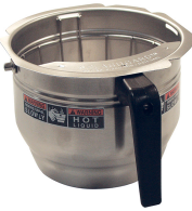
FUNNEL AY,W/DECAL GRT "C"7.62